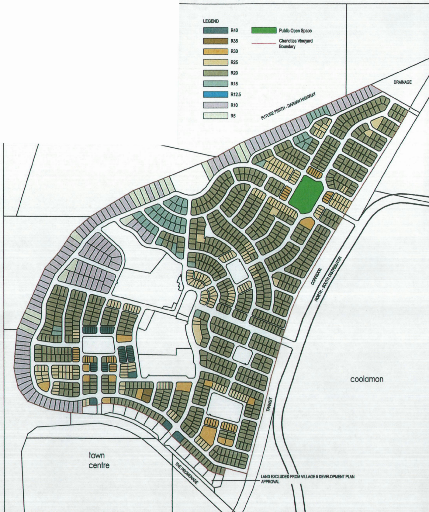
Approved Density Sites Plan