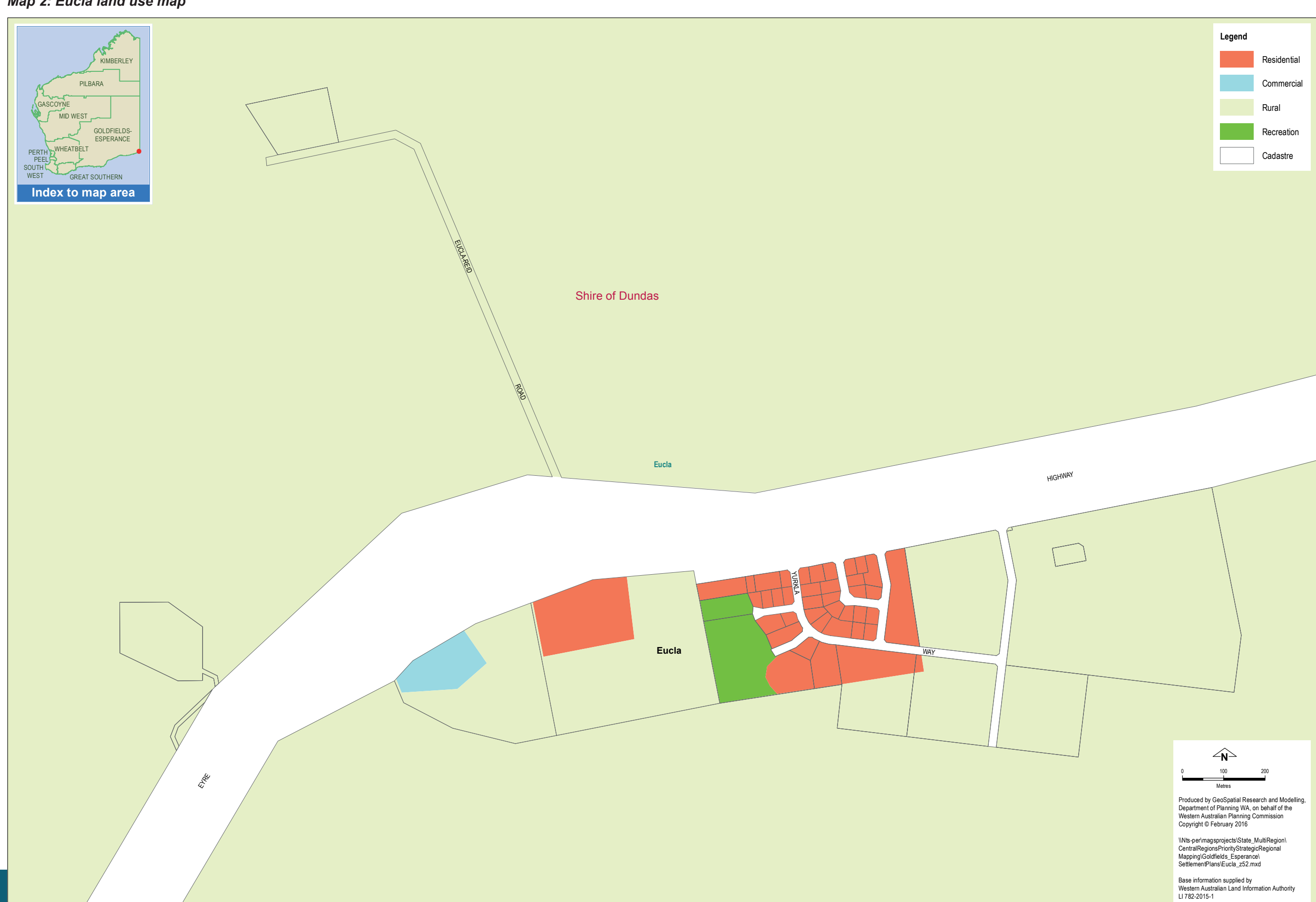
Map 2: Eucla land use map